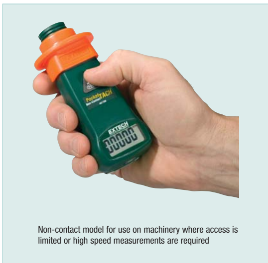
Non-contact model for use on machinery where access is limited or high speed measurements are required